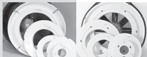
Fig. left: Set flow rings until 09/2009 Fig. right: Actual set of flow rings with clips

Special offer in the context of calibration.